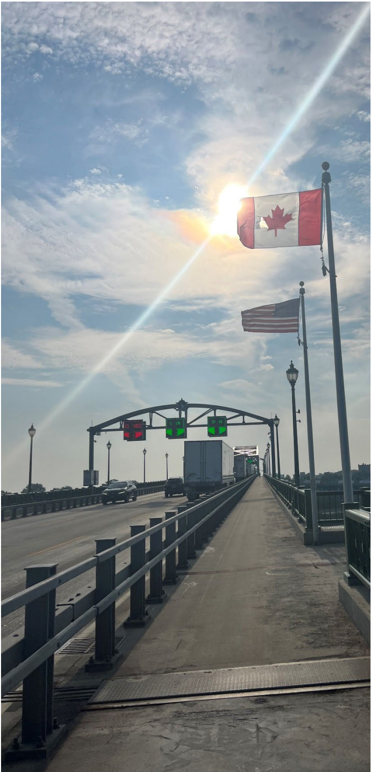
Crossing the Peace Bridge back into the US of A