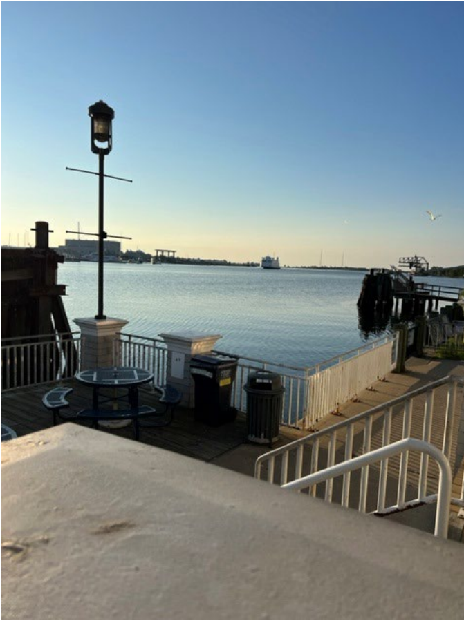
Bridgeport, Connecticut ferry ride back to Long Island.