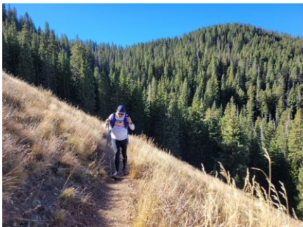
Climbing up into alpine region.